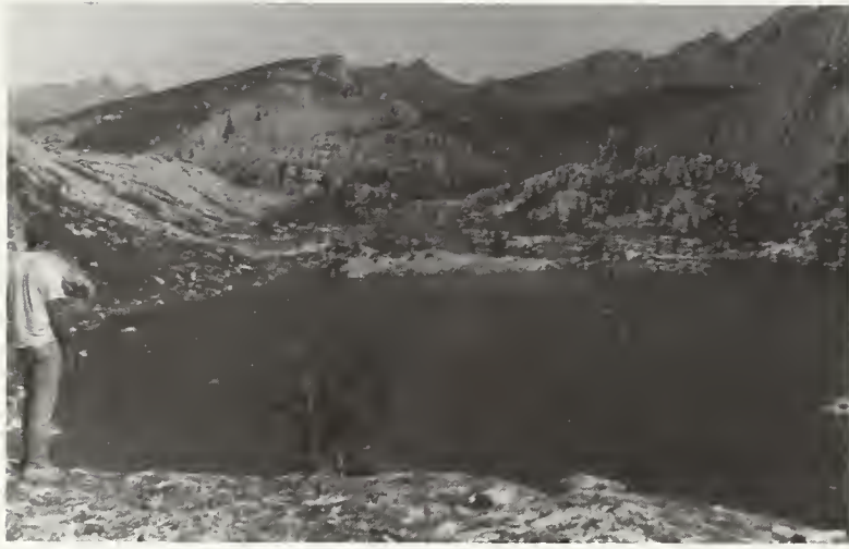
Figure 3 —Lone day hikers were more likely to have permits than day hikers traveling in groups in the Desolation Wilderness.